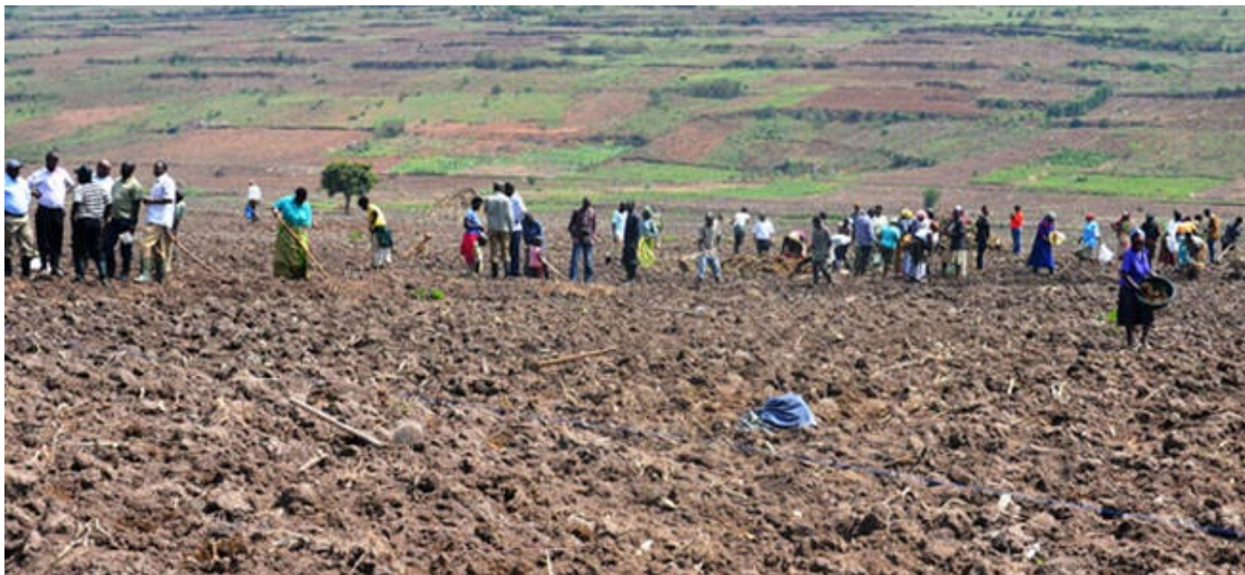
2014A Season Launch in Southern Province