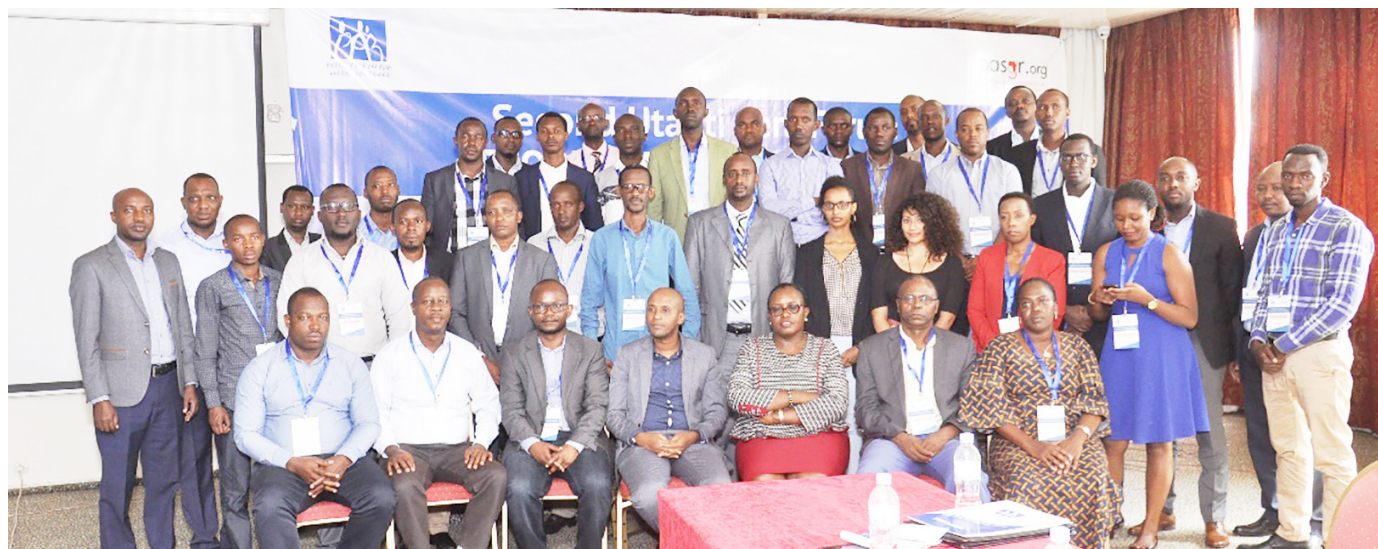
Participants pose for a group photo after the launch of the forum.

Kigali faces an acute shortage of affordable or low-cost housing. Demand for new dwellings in Kigali from 2012 to 2022 will reach 344,068 Dwelling Units (DU), which is equivalent to an average of 31,279 DU per year which is not matched with corresponding supply of around 1000