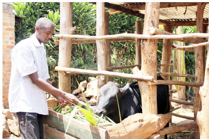
A citizen feeding his cow.

With funding from “Ikiraro Cy’iterambere”, IPAR completed a research project on the “Citizen Participation in Government decision making: The case of agriculture and social protection sectors in Rwanda.” The final report of the project analyses where citizens’ participation does and does not occur along the decision making cycle. It also looks at how citizens have contributed to policy changes. The study consists of a literature review and various consultations at the national and district levels. It brings interesting results in terms of where to strengthen citizen participation in decision making along the policy decision cycle in Rwanda.