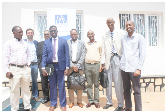
The delegation from Samadoon International Foundation poses for a photo with some of the IPAR-Rwanda Researchers.

The Samadoon International Foundation is a charitable, non-profit and non-partisan organization, which aims to promote peace and social cohesion as well as the improvement of the education and health services throughout the Somali inhabited regions of the Horn and East Africa.