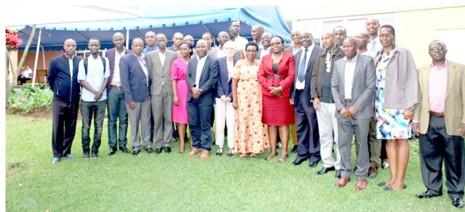
Group photo of the participants

According to the EICV 4, in the western Province, literacy rate among the population aged between 15-24 years stood at 85.3% while among the population aged 15 years and above, it stood at 69.3%.