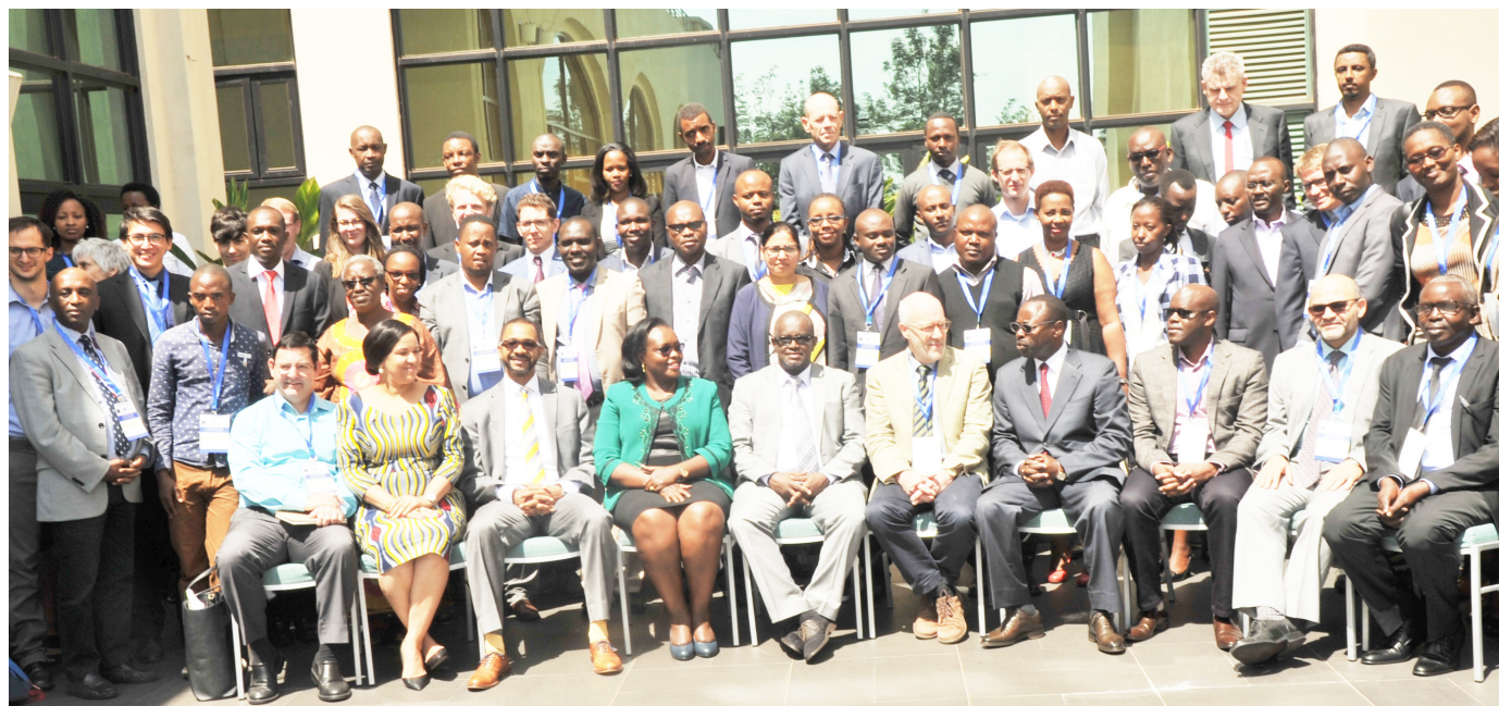
A group of the participants of the 7th IPAR-Rwanda Annual Research Conference.

x. Access to finance and insurance: Stop Impoverishment through availability of Insurance, management of conflict and economic vulnerability as well easy access to credit. The poor need tool kits and business start-ups, safety nets and support instead of direct handouts; Reinforce social protection and establish pension and saving schemes for informal sector in order to ensure there is no shocks and falling back.