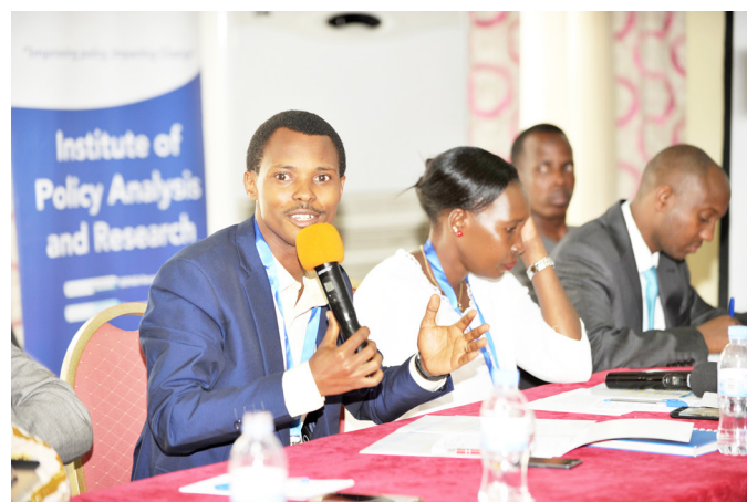
A participant reacting to the discussions during the workshop.