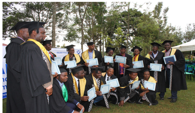
Photo: First cohort of TTC tutors who completed a Diploma Programme in a Social Practice Approach to Adult Literacies in 2019

apply literacy skills to their daily lives. The approach is participatory, competence-based, and learner-centred. This contrasts with the traditional teacher-centred model of adult literacy education which often isolates learning from real-world applications, resulting in reduced retention and limited practical relevance for adult learners (Abbott et al., 2020).