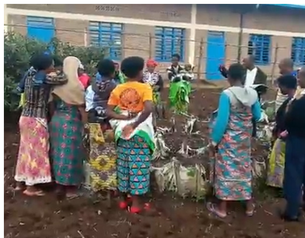
Photo: Adult learners taking part in a compost manure making for kitchen garden case study session.

SPA-ALE has been successfully implemented in three districts in Western Province, namely, Rusizi, Karongi and Rubavu. Research evaluation conducted has found that a social practice approach is more effective than a teacher-centred approach for adult learners. Over 90% of adult learners were satisfied with the participatory and learner-centred teaching methods.